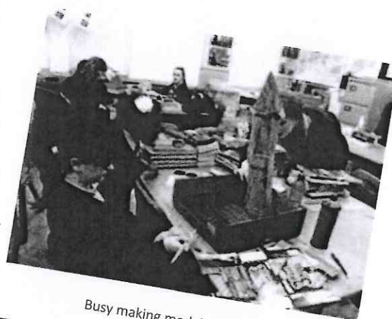
Busy making models of homes

'I loved doing Dissolving Boundaries every week. It was exciting to hear what the other school was doing and to tell them our news'.