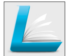
Figure 1 Lexia Reading App