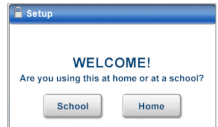
Figure 2 Setup Screen